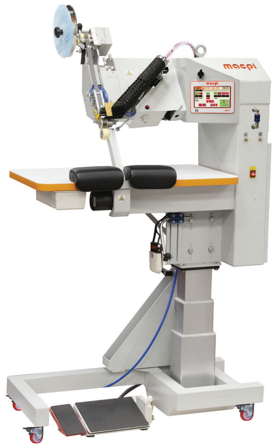
NEW 336.59T seam sealing machine

The stitch-free technology is highly recommended for all technical garments, ranging from recreational outdoor activities to extreme sports and safety wear. To summarize, this application is essential for all garments requiring maximum protection against