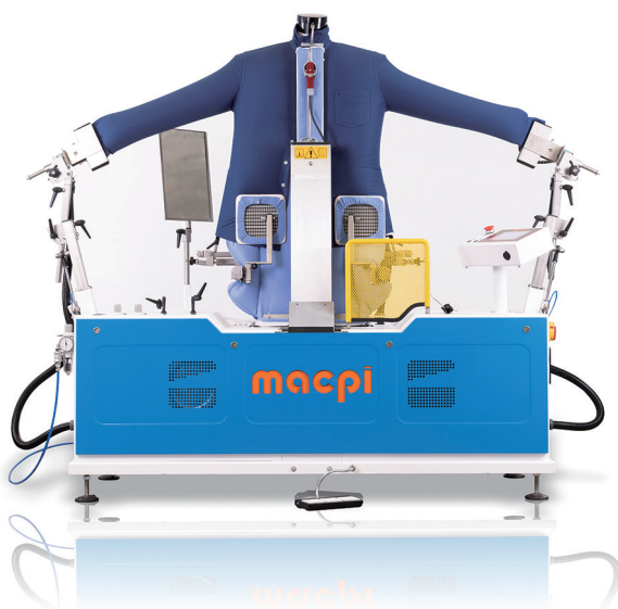
389.20 for shirt ironing