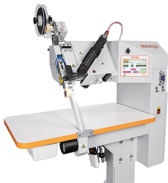
New seam sealing machine 336.59T